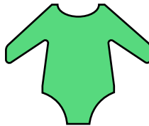
Long Sleeved Vest